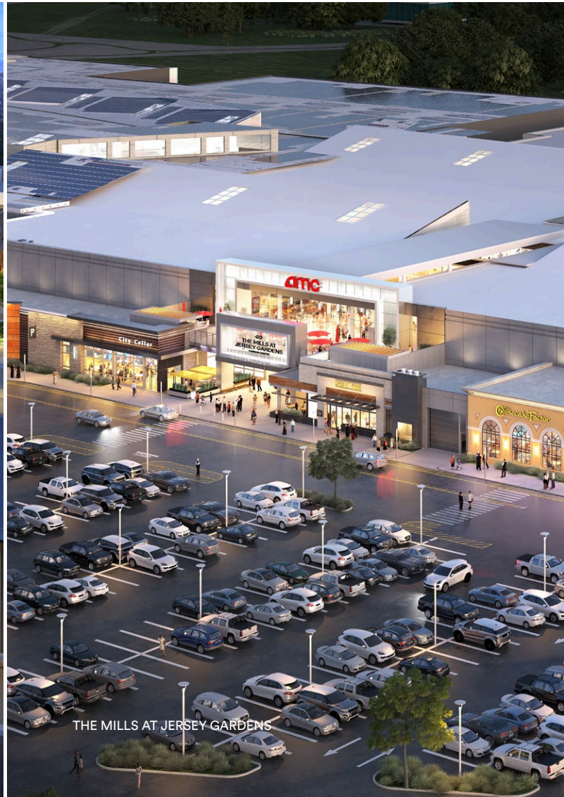
THE MILLS AT JERSEY GARDENS