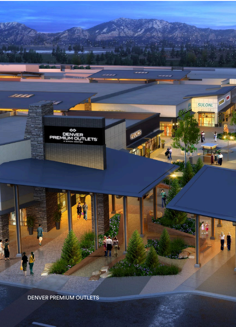
DENVER PREMIUM OUTLETS