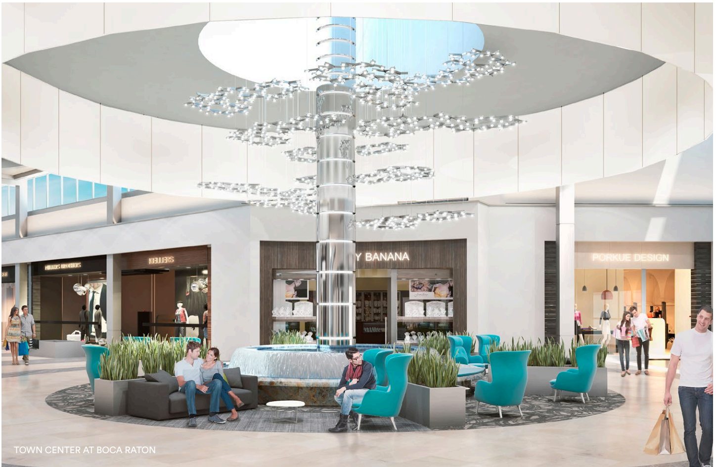
TOWN CENTER AT BOCA RATON