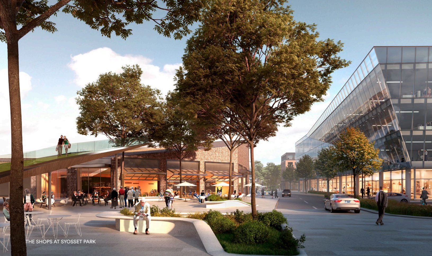
THE SHOPS AT SYOSSET PARK